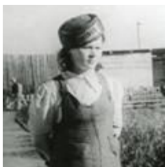
Cilka (From Cilka's Journey by Heather Morris)

(Images are of the people we will meet in today's sermon)