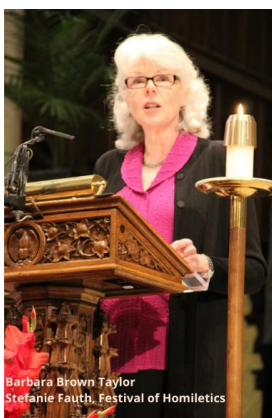
Barbara Brown Taylor

At a time when I needed it most, I stumbled upon the writings of Barbara Brown Taylor, and I saw in her books some of my own spiritual journey. In Part Three of my four-part series of sermons, based on Taylor's four most recent books, we'll explore Learning to Walk in the Dark which asks: How do we cope when we can no longer see the light in our lives? She helps us understand that journeying in darkness, dealing with the things that scares us, often prevents us from seeing the light in our own lives. Over the last two years, we have all been forced to confront the things that scare us. And, if you in turn, will commit to sharing a service with us about your spiritual journey, I have one of her books for you.