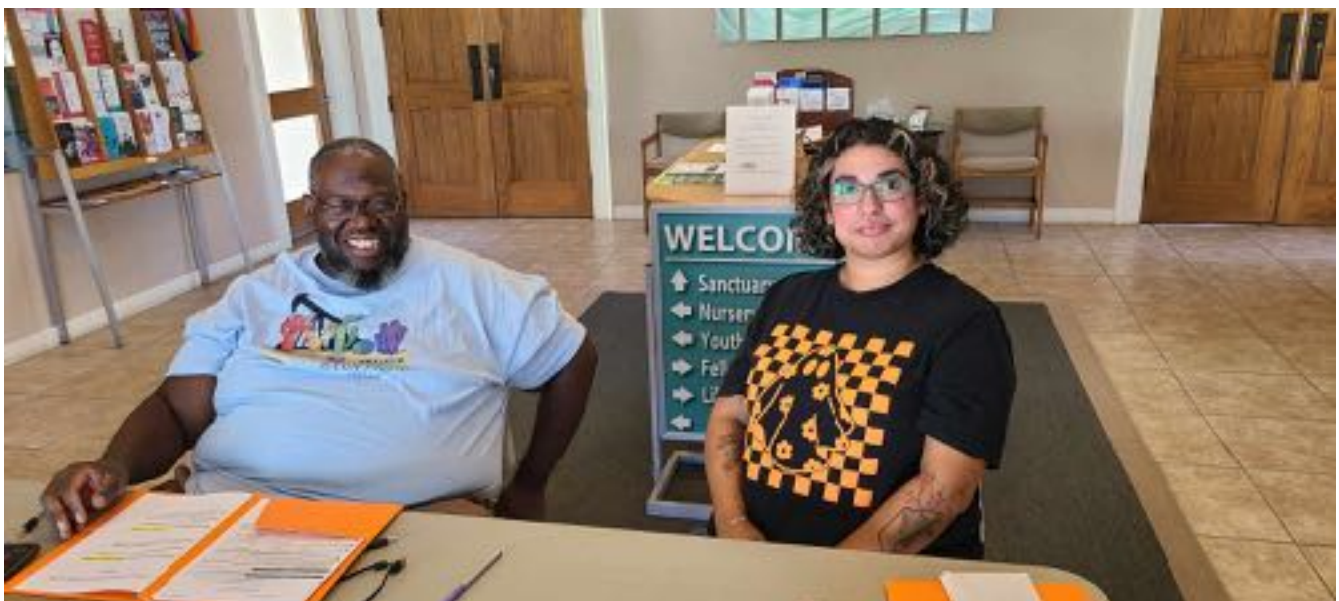
September 28th Voter Registration Event!

If you are interested in helping with our children's religious education, there are many ways that you can participate. You can suggest a story for Spirit Play. You may help to create Spirit Play story. If you are interested in going through Spirit Play training, please contact Barbara Handley at ebhandley@sbcglobal.net or 432-978-5977.